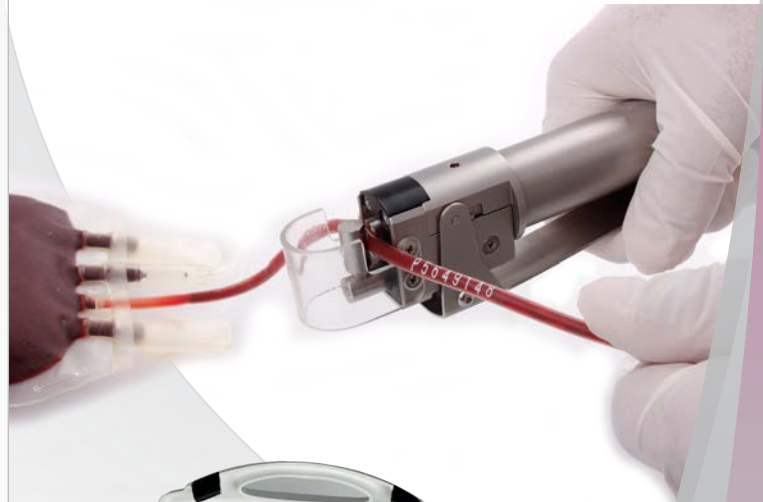
■ Sealing area shape