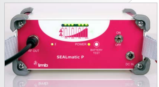
Sealing progress bar: for sealing monitoring