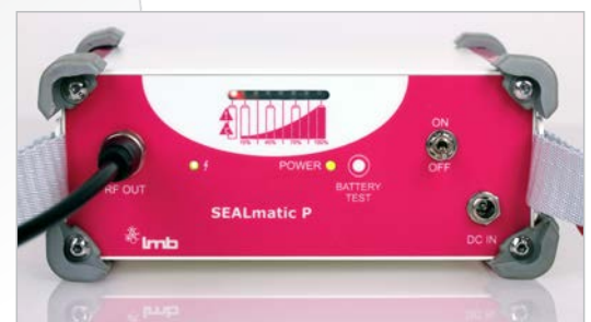
Battery capacity < 10% - sealing not allowed